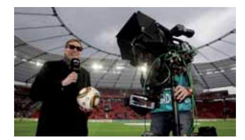
PS-Freestyle on Steadicam for Live Broadcast