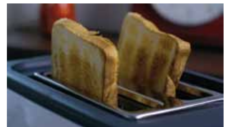
Sunny Sunday Morning @ 450 fps

The all-purpose concept of the PS-Cam X35 allows normal speed and enhanced picture quality up to 11 T-stops with global shutter technology. It provides slow motion capabilities up to 750 fps (1.500 fps MKII) maximum to capture amazing results especially in human action.