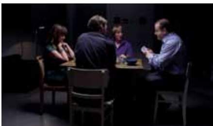
Aces @ 24 fps

PS-Cam X35 Showreel available at http://ps-cam-x35.com http://vimeo.com/pstechnik