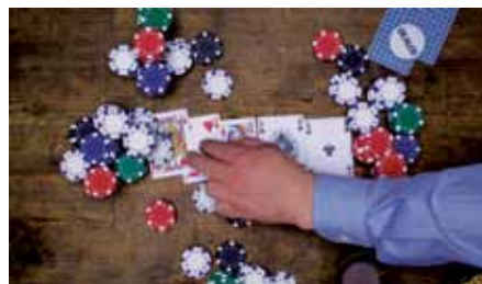
Aces @ 150 fps